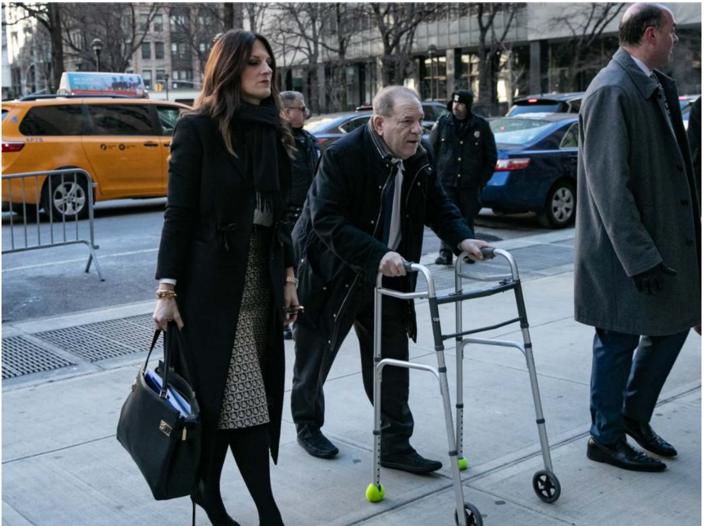
Harvey Weinstein and his lawyer Donna Rotunno arrive at New York City Criminal Court on January 21, 2020 in New York City.